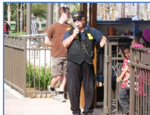
Making the announcement... 56 times!