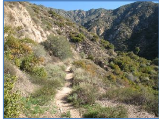
Heading up the right-of-way into Rubio Canyon

Heading back down was a breeze, and in about an hour, we were standing at the spot where the trolley line from Los Angeles met the incline. This time, though, as we looked up to where we had been, a whole new level of respect and sense of awe was felt... or... maybe we were hallucinating from the lack of food and the endorphin overload our bodies were succumbing too. Either way, we were happy of our accomplishment and couldn't stop thinking about the big, greasy, chilly burgers waiting for us at the Tommy's Burgers just down the road.