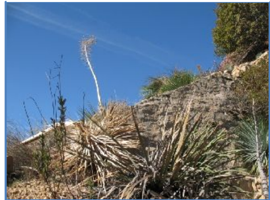
A retaining wall on the Incline Railroad