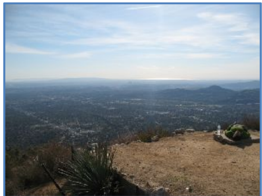
The view from the top of the incline at Echo Mtn.