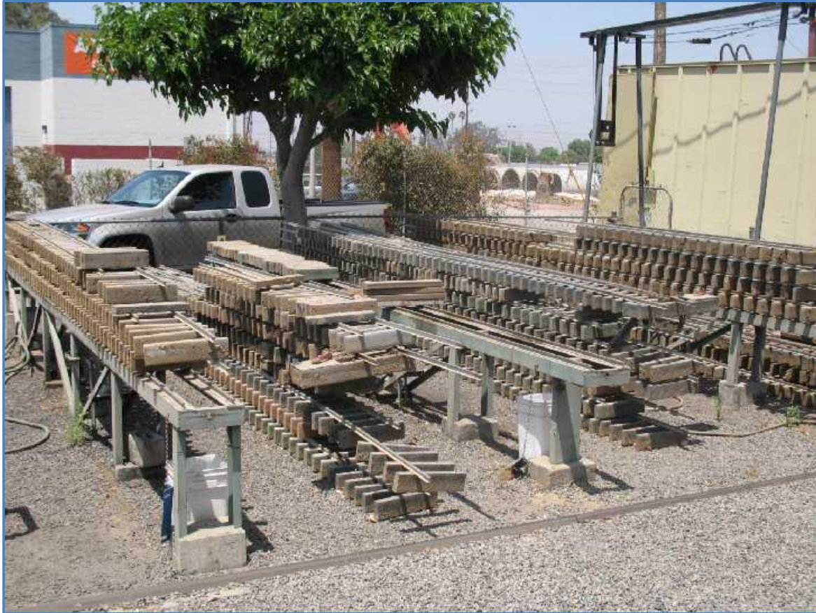
One year ago: Stacks and stacks of tracks. Though our steaming bays were home to our disassembled compound lead for several months, these tracks were just about to be re-placed onto their new roadbed in late July, 2009.